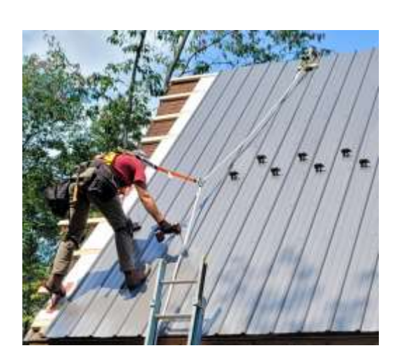
*NEVER use the SataMount MRM as a roof anchor tie-off point.